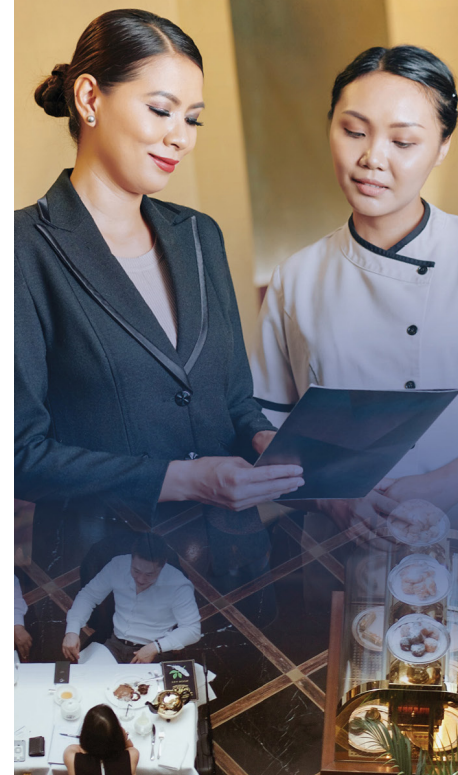
Total Hospitality Apprentices Served, Fiscal Years 2020–2024

Employers in the hospitality industry across the U.S. and around the world use the Registered Apprenticeship training model to recruit, train, and retain workers with the right skills. Registered Apprenticeship has been the most effective training model for enhancing business performance and competitiveness.